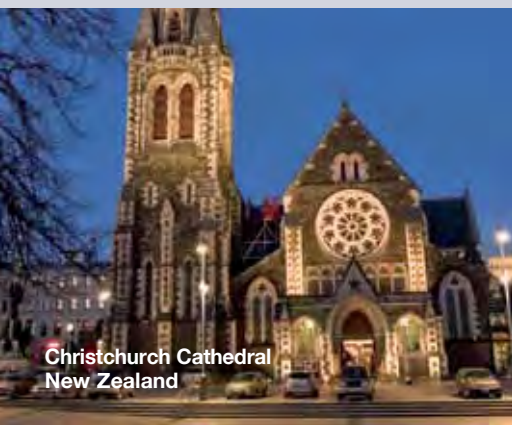
Christchurch Cathedral New Zealand

All air, cruise, and land accommodations, local transportation, and optional shore excursions are arranged by Oceania Cruises, who may use other suppliers or providers to render the services. The agreement in this brochure is the exclusive and entire statement of the agreement between you and Go Next, Inc. It should be read carefully.