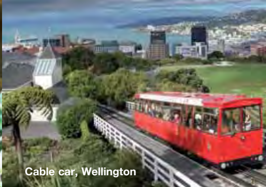
Cable car, Wellington