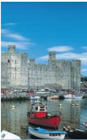
mightiest link in his Iron Ring