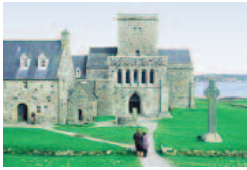
Tour the Abbey of Iona, Scotland's holiest spot since the sixth century A.D. and traditionally believed to be where the Book of Kells was created.