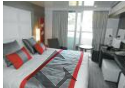
Stateroom with balcony

Ninety-five percent of the large, deluxe, air-conditioned, outside Staterooms and Suites (from 200 to 484 square feet) feature private balconies. Most accommodations have two twin beds that convert to one queen-size bed; each has a private bathroom with shower (bathtub in limited number of staterooms), and the luxurious amenities of a fine hotel, including: individual climate control, satellite flatscreen television, wireless Internet access, safe, minibar, full-length closet, writing desk/dressing table and plush robes.