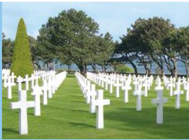
The American Military Cemetery at St. Laurent, France, honors the soldiers who made the ultimate sacrifice during the D-Day landings.

In later years, Iona became the burial place of Scotland's kings, including Duncan and Macbeth. Upon arrival at the Abbey, view the churchyard's intricate Celtic crosses and stroll through the serene, restored monastery. Afterward, cross the Sound of Iona by ferry to the neighboring Isle of Mull, and continue east along the shore of Loch Scridain, watching for shorebirds, seals and red deer. Visit the 13th-century Duart Castle, the ancestral home of the Clan Maclean. A boxed lunch will be served at the castle. Conclude this afternoon in the sheltered port of Tobermory, where houses painted in vivid shades of blue, red and green are nestled between the hills and the harbor. After free time in Tobermory, reboard the ship and depart for Skye.