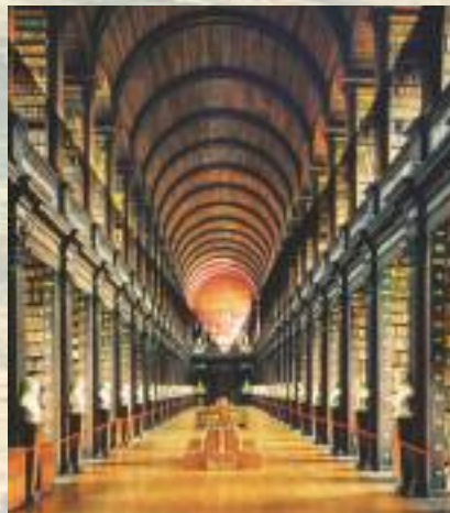
A walk through the Long Room of Trinity College's Old Library showcases 200,000 of the library's oldest books, with the Book of Kells on display in the adjacent Treasury.