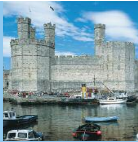
Explore Edward I's impressive Caernarfon Castle, the largest of 13th-century fortresses across North Wales.