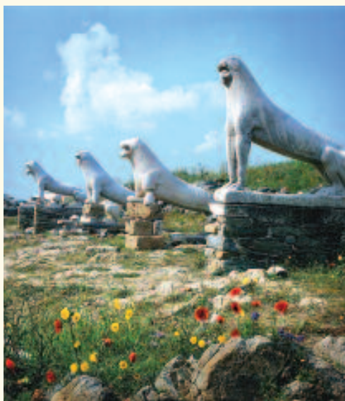
Explore the glories of Delos, where these lions were masterfully crafted 600 years before Christ.