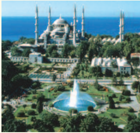
The splendid and graceful Blue Mosque is one of the most beautiful Ottoman monuments in the world.

pilgrimage site and place of religious study. St. John the Apostle of Ephesus was known to have been exiled to Pátmos for 18 months and very possibly wrote the Book of Revelation here in A.D. 95.