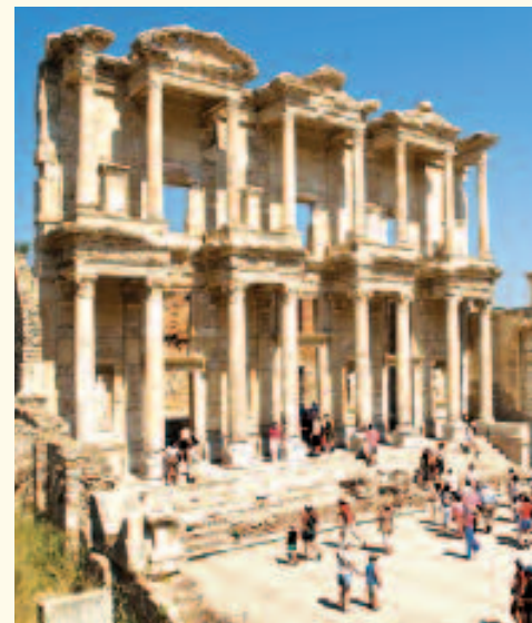
Stand beneath the great marble columns at the Library of Celsus, Ephesus' iconic monument built in 135 A.D.

*Optional C'est Bon! CULINARY TRADITIONS™ and cultural excursions are available at additional cost and details will be provided with your reservation confirmation.