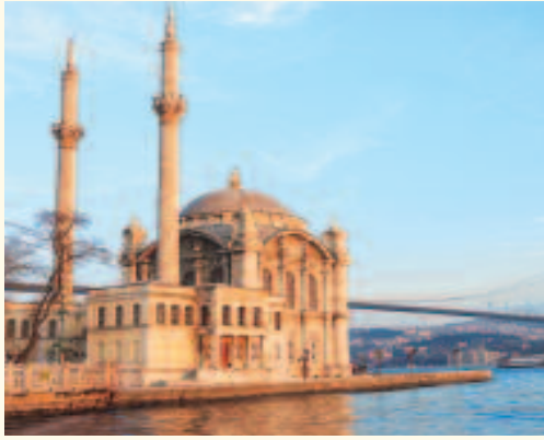
The spectacular Bosphorus Bridge in Istanbul spans between the two continents of Europe and Asia.