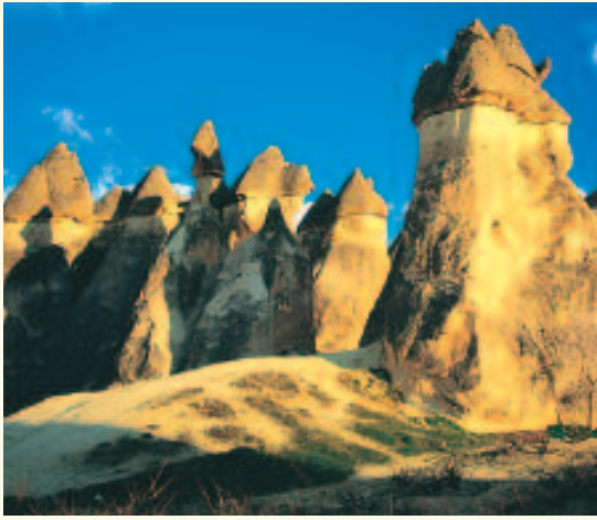
Walk through the surreal volcanic stone forests of otherworldly Cappadocia.