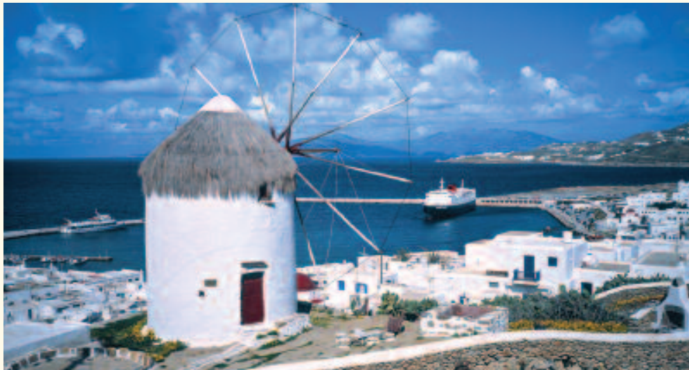
Experience the timeless traditions and scenery of the Greek Isles in Mykonos. Inset above: The incomparable Parthenon on the Acropolis.

Scheduled guest speakers may be altered due to circumstances beyond our control. See Terms and Conditions.