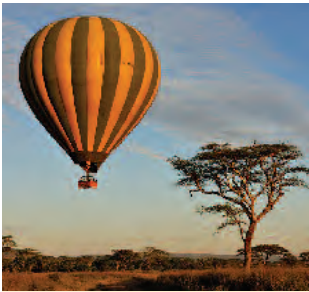
Enjoy stunning views of the Serengeti ecosystem as the sun rises over the national park.