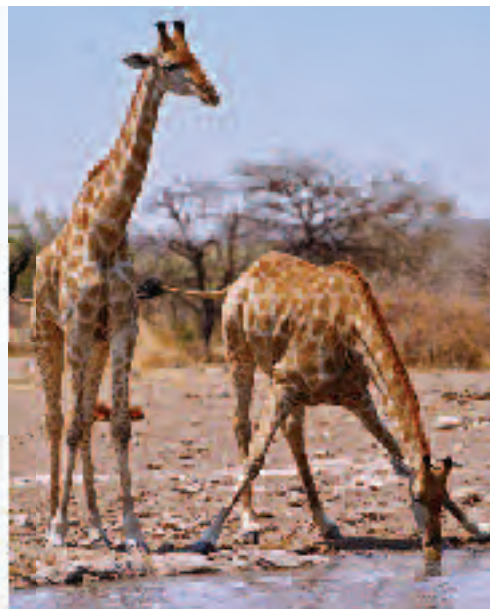
Giraffes can go weeks without stooping to drink, relying instead on water from dew and acacia leaves.