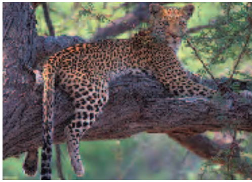
Watch for the elusive leopard, a master of concealment, relaxing on large tree branches.