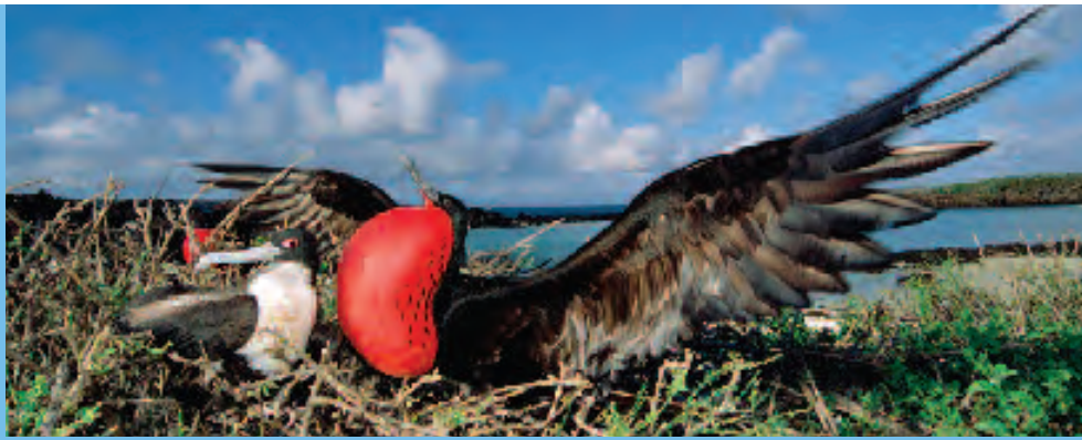
Look for the unusual mating “dance” of the magnificent frigate birds, one of the Galápagos Islands’ hallmark species.