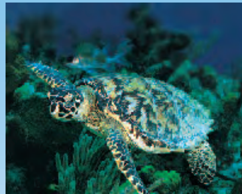
The graceful Pacific green sea turtle is the only marine turtle to nest regularly on Galápagos beaches.

Arrive this morning on the shores of San Cristóbal, the first Galápagos island Darwin landed on in 1835. Transfer to the airport and fly to Guayaquil. Invigorated by trade with the Far East, this city became one of the wealthiest on the continent, a status that made it a favored haven for English and Dutch buccaneers in the 17th and 18th centuries. See the historic markets and shipyards; visit famous Bolivar Park, where playful iguanas scamper through its grounds; and stroll past historical and cultural monuments along the Malecón 2000 promenade overlooking the Guayas River. Check into the deluxe HILTON COLÓN HOTEL and join your traveling companions for a farewell reception.